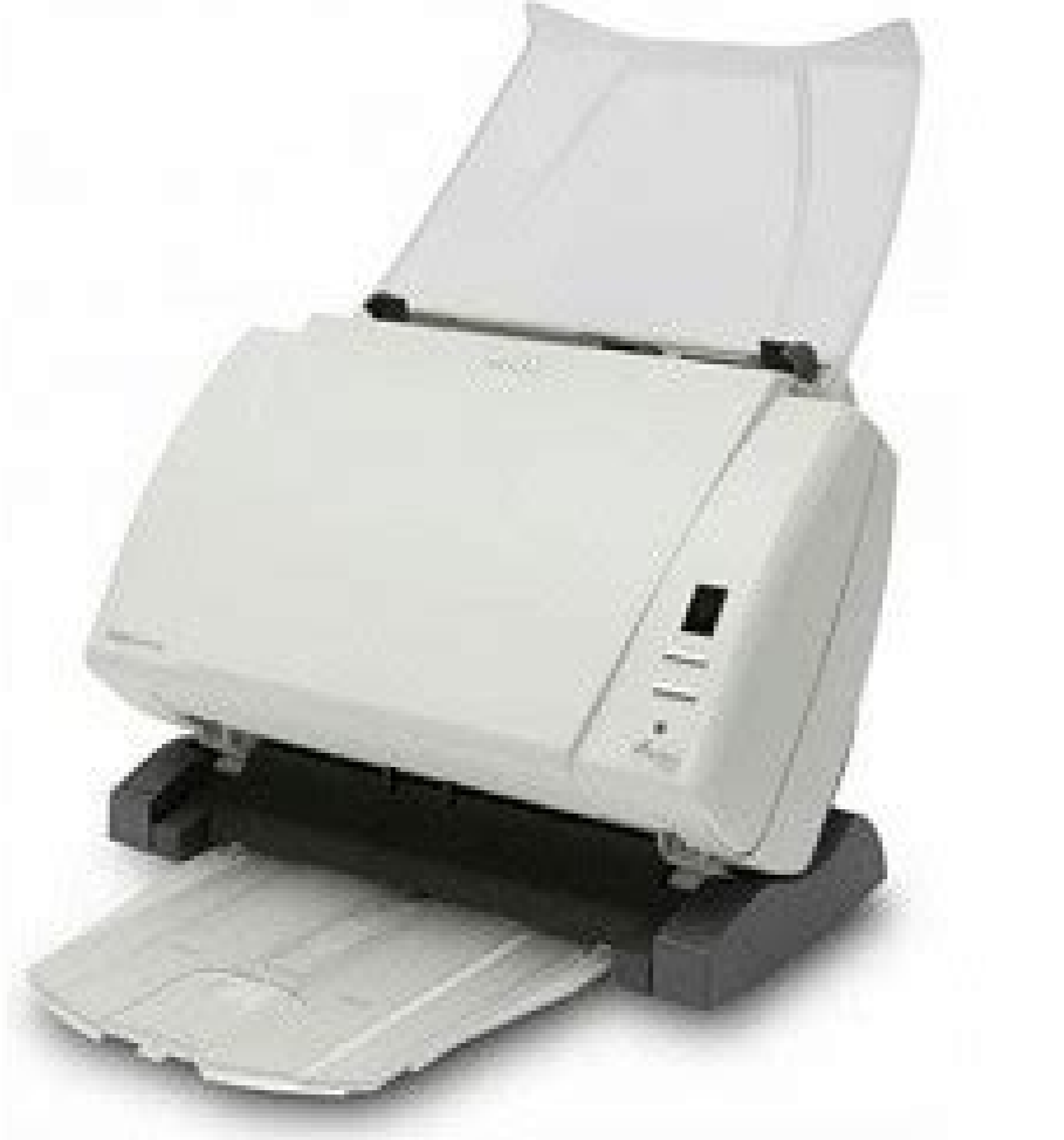
Kodak scanmate i1150 price in pakistan. Kodak scanmate i1120 price.